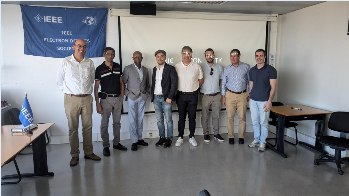
Photo-3: With IEEE Portugal leaders at Telecommunication Institute, Lisbon, France