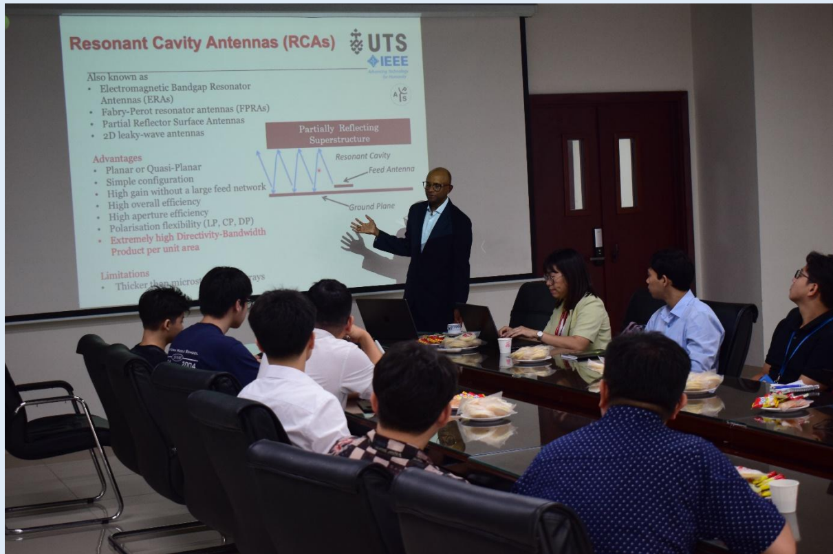
Photo-1: IEEE Distinguished lecture at Hanoi National University, Vietnam